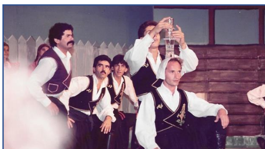
DANCE OF THE CUPBOARDS